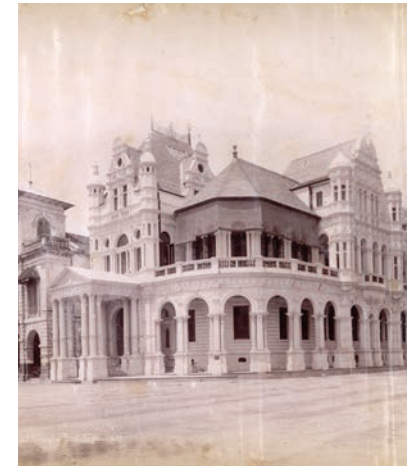
Hongkong Bank building in Collyer Quay (1893)