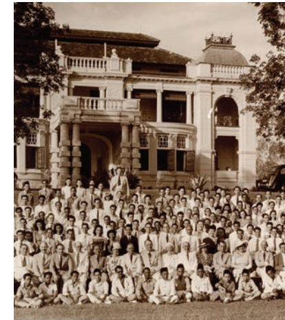
Singapore staff outside of the Singapore Manager's house at Mount Echo (1947)